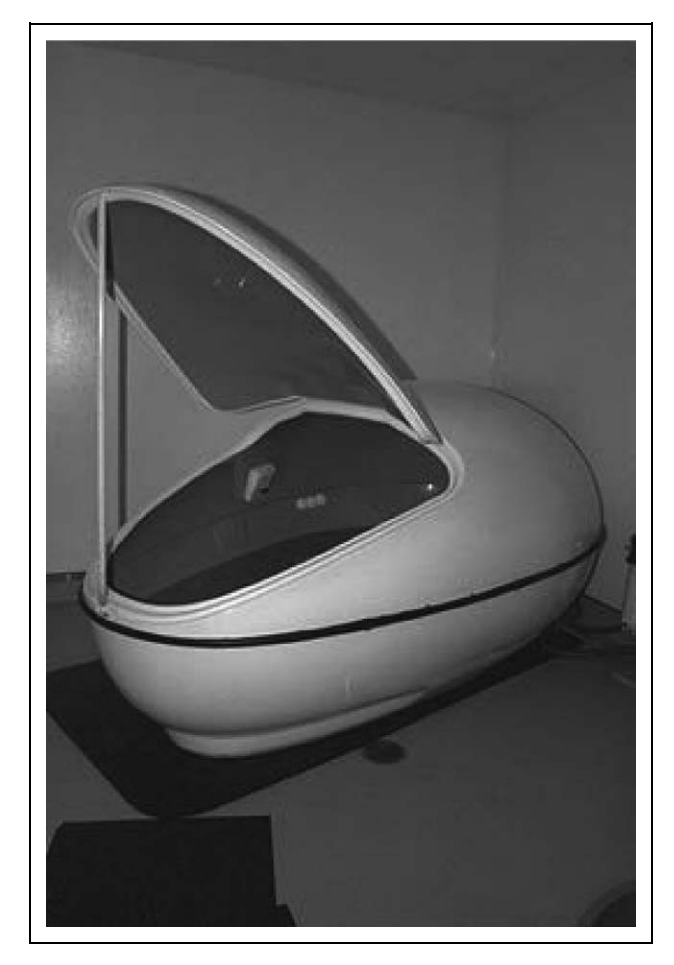
Figure 1. The flotation tank.

for each hand. This is an "active touch" task controlled by the contralateral hemisphere. The results demonstrated greater improvements in sorting times for the left hand in participants in the flotation group, suggesting relative processing enhancement in the right hemisphere. In addition, the results of the Warrington Recognition Memory test demonstrated improved memory for faces but not for words in the flotation group. To the extent that memory for words and faces is preferentially processed in the left and right hemispheres, respectively, the results from this test also point to relative right hemispheric processing enhancement following flotation REST. However, the hypothesis that flotation REST affects interhemispheric dynamics remains to be tested directly using physiological methods.